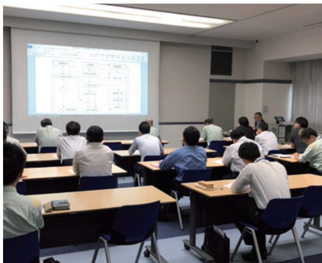
Internal Environmental Auditor training courses (environmental education, when held in FY2019)