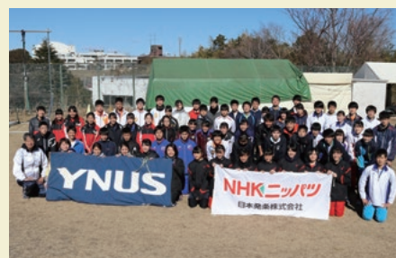
Participants from Kanagawa

*NHK Spring conducts ventures to spread and revitalize various sporting for local communities thanks to the cooperation of Yokohama National University.