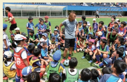
Junior Soccer School with the participation of 139 children