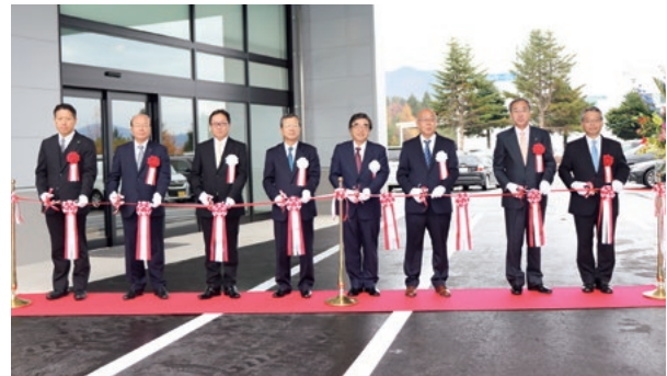
NHK Spring representatives attending the completion ceremony