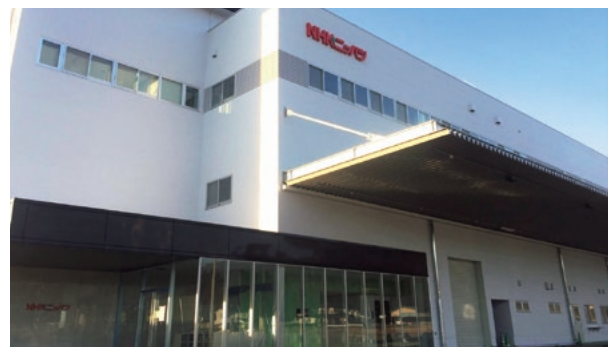
Completed Building at Miyada Plant

Industrial machinery & Equipment Division newly established the Miyada Plant. The Miyada Plant was built on the premise of the second chemical products plant in Miyada located in Ina City, Nagano as the second site for parts used in the manufacturing of semiconductors produced at the Isehara Plant. Construction began in January 2018 and was completed in March 2019. The completion ceremony was held on June 5, 2019.