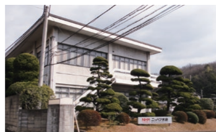
NHK Seating Mizushima beginning production

NHK Seating Mizushima, established in July 2017, leased a plant and equipment from local companies and started production of automotive seats ordered by Mitsubishi Motors in January 2018. NHK Seating Mizushima is currently moving forward with the setup of a new production line inside Mitsubishi Motors Corporation's Mizushima Plant.