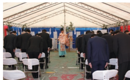
Safety ceremony held at the Shinto services

On January 22, 2018, a safety ceremony was held at the intended site of the new plant in Miyada, Nagano. The Miyada Plant will be established on the site of the Chemical Products Department and will be the second plant to produce components for equipment to manufacture semiconductors for the Chemical Products Department, which are currently being made by the Isehara Plant. We plan to begin production after the plant is partially complete in order to handle the rapid need for increased production. Production and construction will proceed simultaneously.