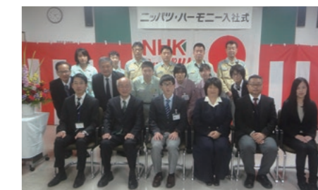
Welcoming ceremony at the Shiga Sales Office for three new employees

Nippatsu Harmony, a special subsidiary for persons with disabilities, opened the Shiga Sales Office in April 2017 and began operations by recruiting three new employees. This is our first sales office in western Japan.