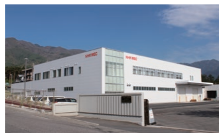
Finished new wing at MEC

On May 29, 2017, NHK MEC Corporation (hereinafter "MEC") held a ceremony to lay the cornerstone for the new extension of the Komagane Plant in Komagane City, Nagano. The production space and other areas of the MEC Komagane Plant had become narrow and, in anticipation of further business expansion in the medium and long term, an extension was built on the neighboring lot. We completed this new wing in 2018 and held a completion ceremony on May 17.